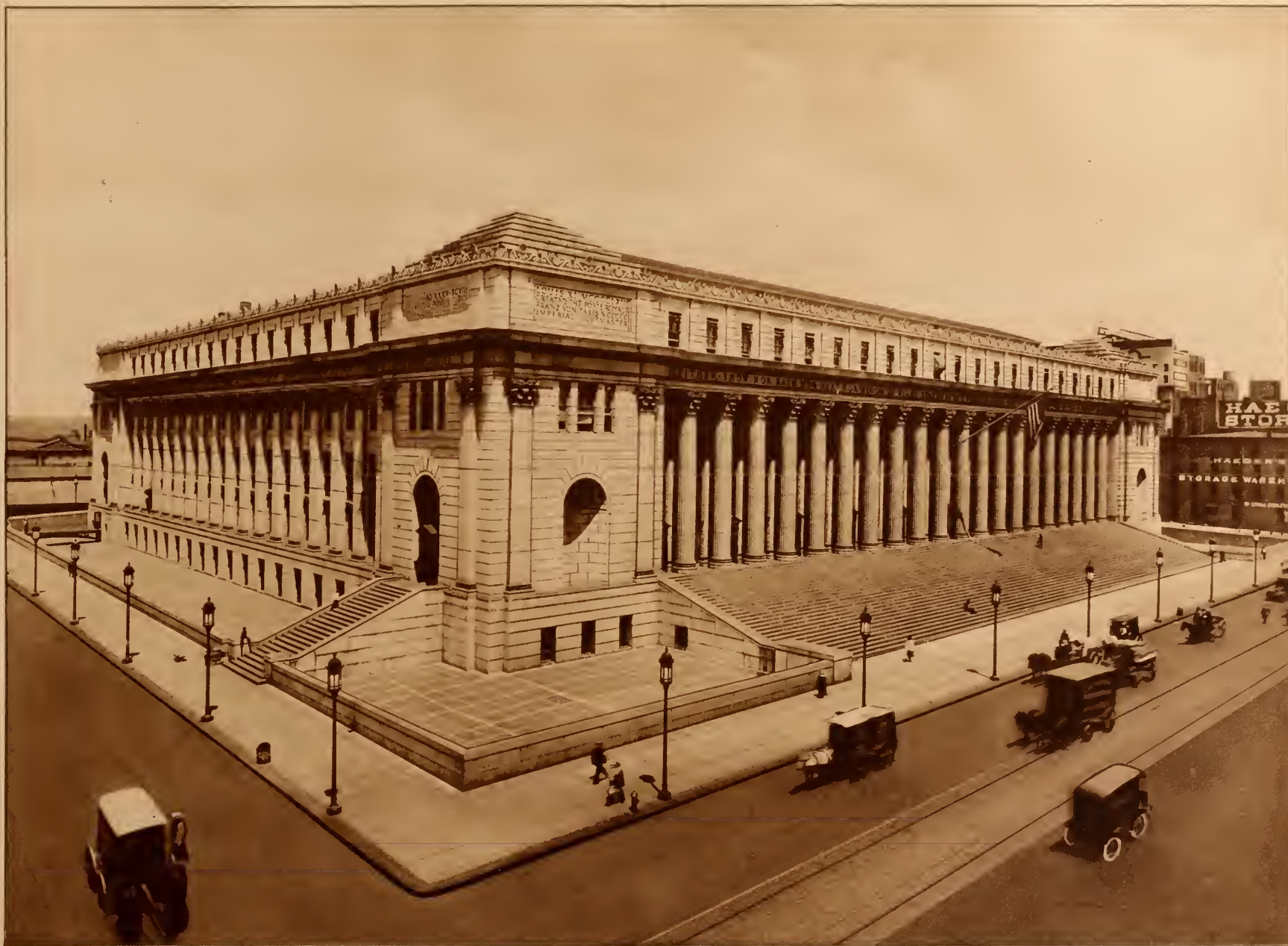
NEW POST OFFICE BUILDING, situated on 8th Avenue, between 31st and 33d Streets. This handsome building was completed in 1913 at a cost of $6,200,000. It faces the Pennsylvania Terminal and is built over the tracks of the Pennsylvania Railroad. The building covers a plot 375 by 335 feet and is built of granite in classic style of architecture.